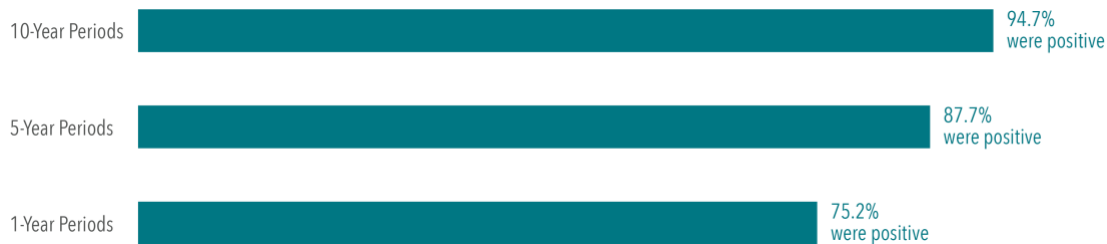
Exhibit 2. Frequency of Positive Returns in the S&P 500 Index Overlapping Periods: 1926–2018

In US dollars. From January 1926–December 2018, there are 997 overlapping 10-year periods, 1,057 overlapping 5-year periods, and 1,105 overlapping 1-year periods. The first period starts in January 1926, the second period starts in February 1926, the third in March 1926, and so on. S&P data © S&P Dow Jones Indices LLC, a division of S&P Global. Indices are not available for direct investment. Index returns are not representative of actual portfolios and do not reflect costs and fees associated with an actual investment. Past performance is no guarantee of future results. Actual returns may be lower.